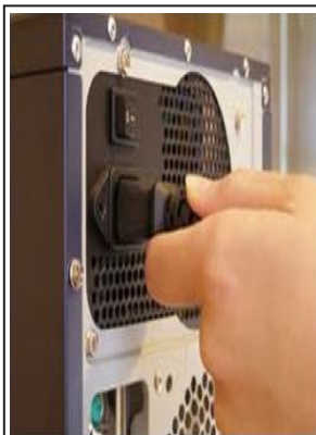
Power struggles in the office

You can spend thousands of dollars on the very best hardware and software and still have a major system failure if you don't have clean, consistent power. Another mistake made very often is thinking that just buying something new will resolve all your issues. If you put the same dirty power problems on new equipment, you will start stressing and degrading your new equipment the day you bring it home, lowering the life expectancy of your product as well. Did you know that "power caused" problems are not covered under most manufacturer's warranties since they can't control the type of power you put to their equipment? Power outages only account for 50% of all disturbances. The